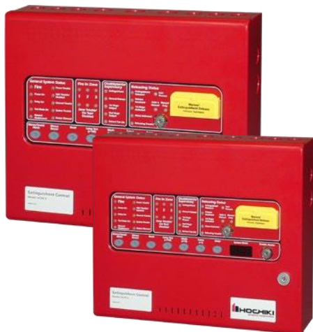
Hochiki Conventional Releasing Fire Alarm Control Panel