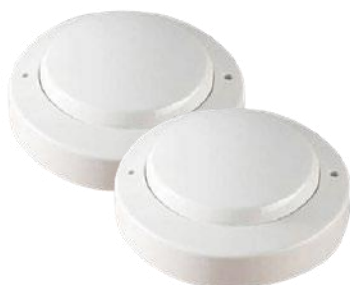
Hochiki ROR Heat Detector