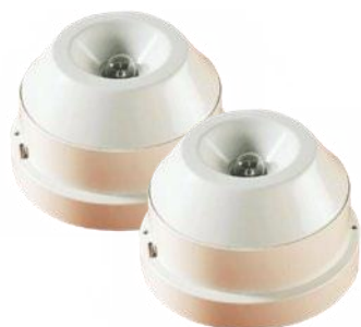
Hochiki Flame Detector