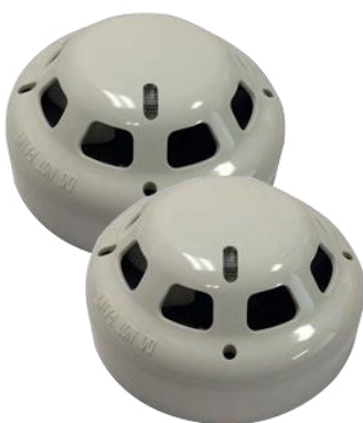
Hochiki Photoelectric Smoke Detector