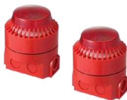
Canatech Electronic Sounder and Beacon