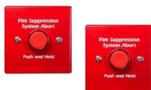
Hochiki Abort Switch

Operating Temperature: -30°F (-35°C) ~ 150°F (66°C)