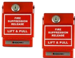
Hochiki Manual Pull Station