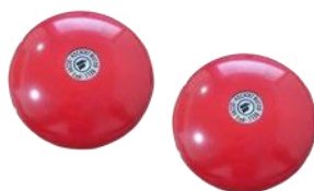
Hochiki Fire Alarm Bell