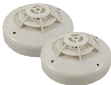
Hochiki Fixed Heat Detector