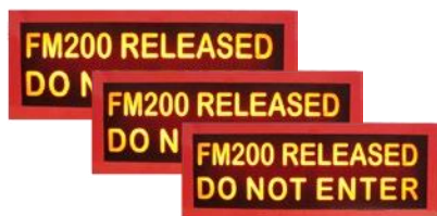
Canatech Discharge Warning Box