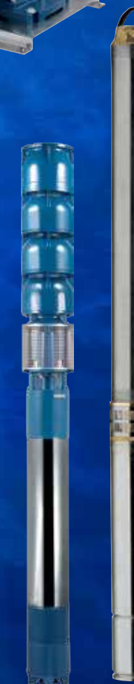
SUBMERSED PUMPS & MOTORS