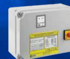
ACCESSORIES AND MORE