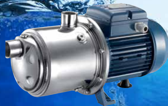
CENTRIFUGAL MULTISTAGE PUMPS