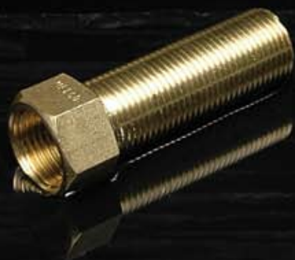
MCF509 MI x FI Extension Piece 1/2" x 3"