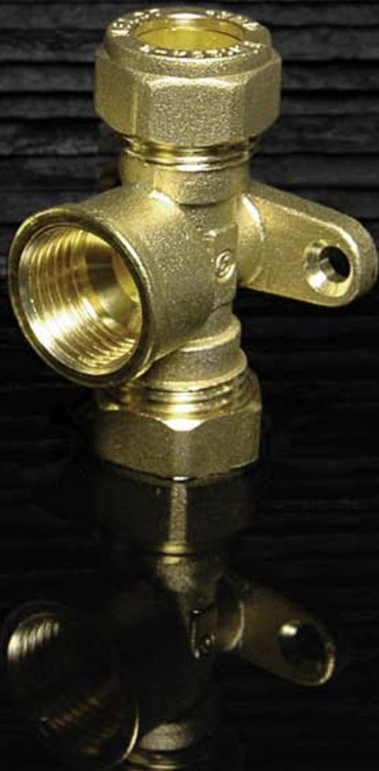
MCF306 C x C x FI Wall-Plate Tee