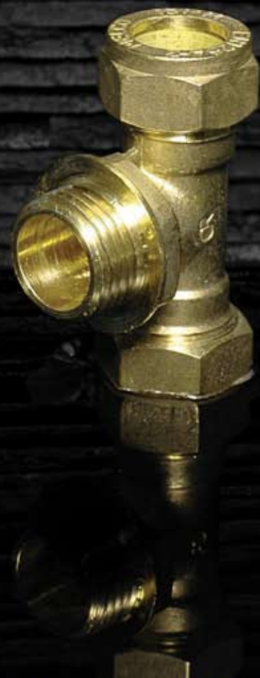
MCF302 C x C x MI Tee