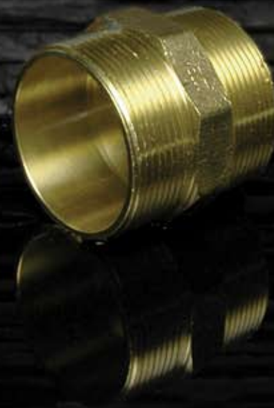
MCF403 MI x MI Nipple

3/8" x 3/8" 1" x 1" 1/2" x 3/8" 1 1/4" x 1 1/4" 1/2" x 1/2" 1 1/2" x 1 1/2" 3/4" x 1/2" 2" x 2" 3/4" x 3/4" 2 1/2" x 2 1/2" 1" x 1/2" 3" x 3" 1" x 3/4" 4" x 4"