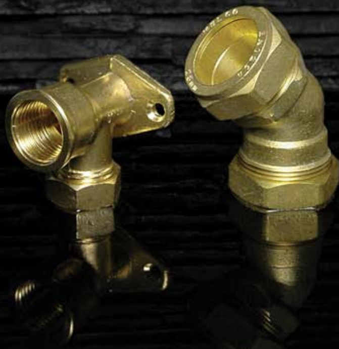
MCF204 C x FI Wall-Plate Elbow