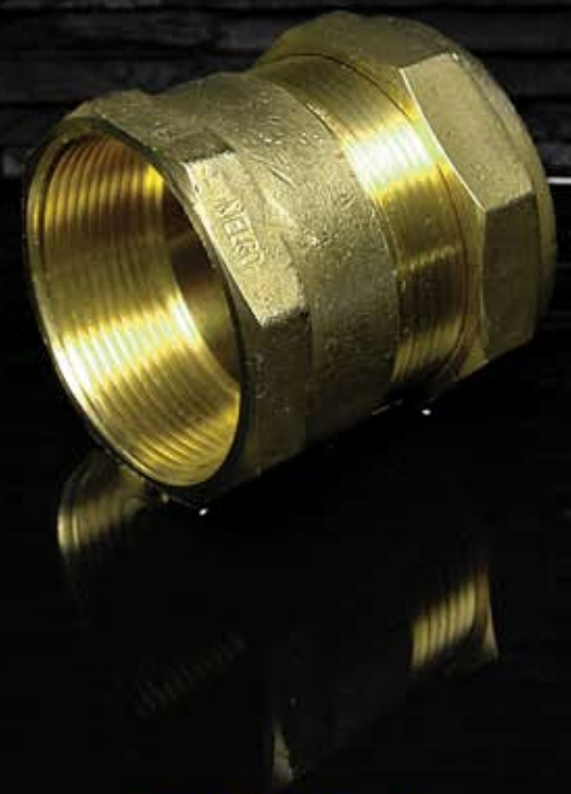
MCF103 C x FI Straight Coupler