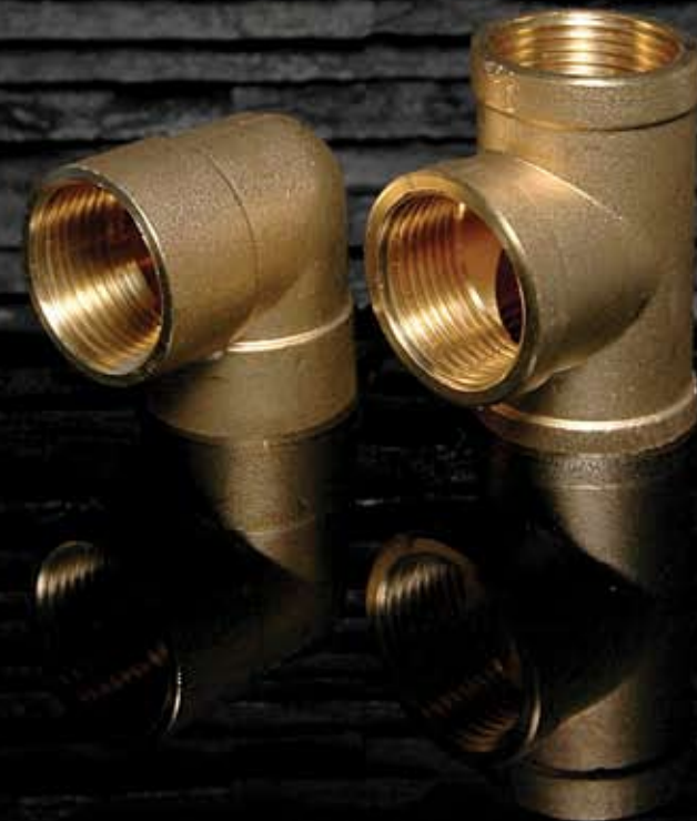
MCF602 FI x FI Female Elbow