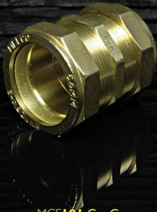
MCF101 C x C Straight Coupler