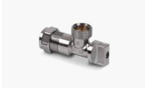
CXMI ANGLE BALL VALVE