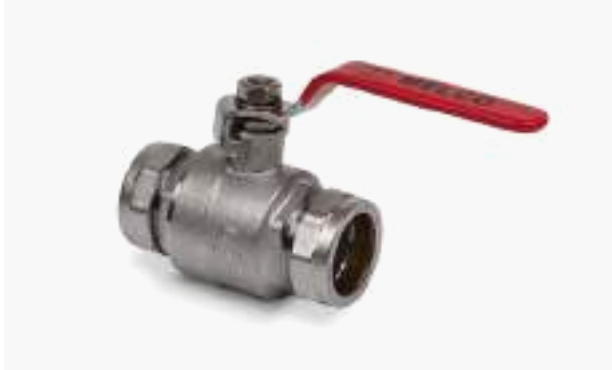
CXC FULL BORE BALL VALVE C/W RED HANDLE