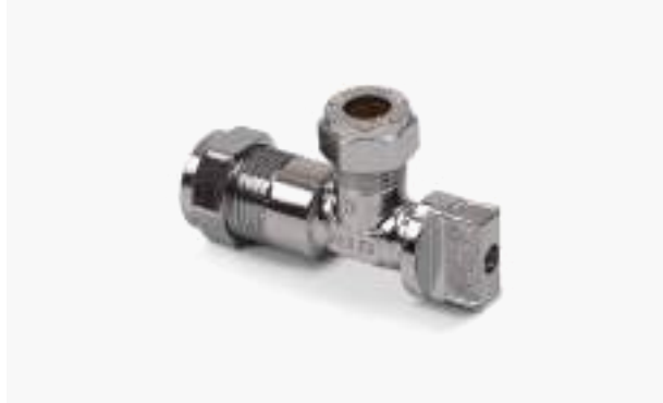
CXC ANGLE BALL VALVE