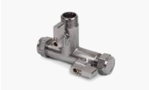
CXMIXMI TWO-WAY BALL VALVE