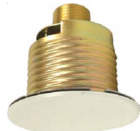
2 3/4" diameter plate