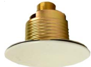
3 5/16" diameter plate