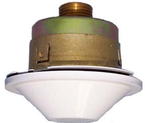
WHITE CONCEALED PENDENT