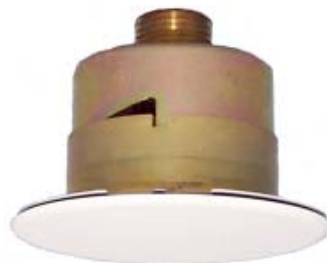
WHITE CONCEALED PENDENT