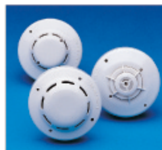
PART No. HCD1/TSS1/JAN04

HOCHIKI CORPORATION 10-43, KAMIOSAKI 2-CHROME SHINAGAWA-KU, TOKYO 141-8660, JAPAN TELEPHONE: 81-3(3444)4116 FACSIMILE: 81-3(3444)4167 EMAIL: overseas@hochiki.co.jp www.hochiki.co.jp