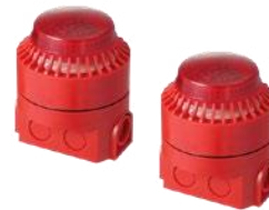
Canatech Electronic Sounder and Beacon

Part Number: CA-17ESB Voltage: 24V DC Current Consumption 24V DC (tone 3): 14.5mA Volume Control: 0 to - 20dB adjustment Ambient Temperature: -25°C ~ +80°C Material: ABSplastic Dimensions: 92.5mm(Dia.) x 110mm(H) Weight: 278g