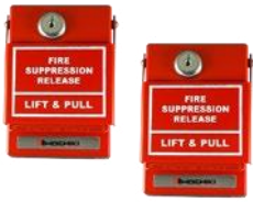
Hochiki Manual Pull Station

Part Number: HPS-DAK-SR Contact: Form Contact Rating: 10A @ 120 VAC Temperature Range: -30°F- 150°F (-35°C-66°C)