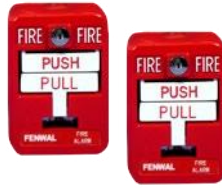
Manual Pull Stations Series 3300

Part Number: HPS-DAK-SR Contact: Form Contact Rating: 10A @ 120 VAC Temperature Range: -30°F- 150°F (-35°C-66°C)