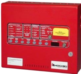
Hochiki Conventional Releasing Control Panel