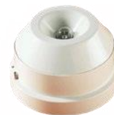
Hochiki Flame Detector