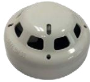
Hochiki Photoelectric Smoke Detector