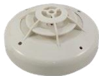
Hochiki Fixed Heat Detector