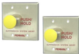
Series 1930 Suppression System Abort Station

Part Number: HCVR-AS-R Switch Rating: 1A @ 30VDC Dimension: 3.81" W x 3.81" H x 2.32" D Finish Colour: Red