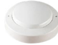
Hochiki ROR Heat Detector