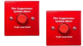
Hochiki Abort Switch

Part Number: HCVR-AS-R Switch Rating: 1A @ 30VDC Dimension: 3.81" W x 3.81" H x 2.32" D Finish Colour: Red