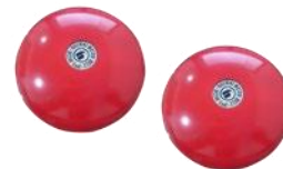
Hochiki Fire Alarm Bell

Part Number: CA-DCW-FM200 Voltage: 24VDC Ambient Temperature: - 25 - +70Deg Dimensions (mm): H150xW400xD85 Material: BlackSteel Finish Colour: Red