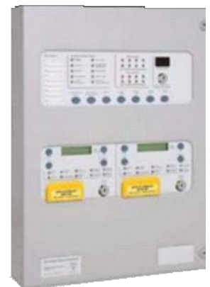
Kentec Multi-Area Releasing Control Panels